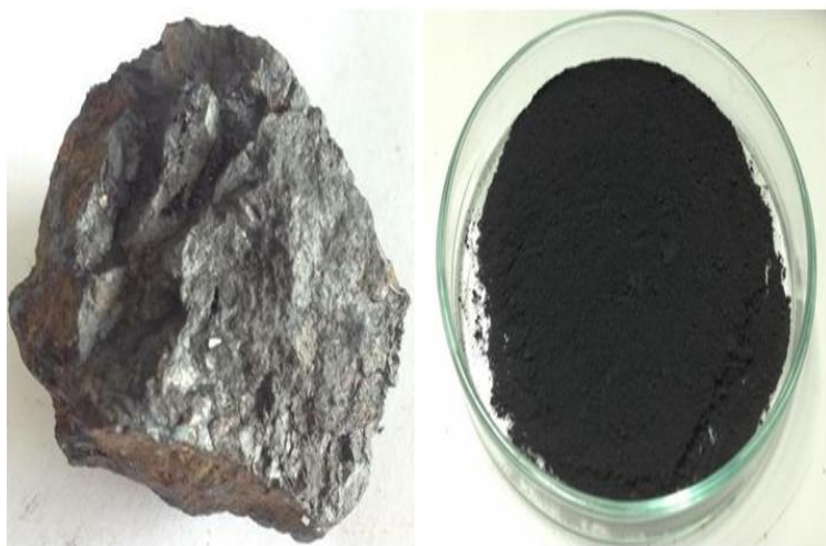
Mineral specimens and powder